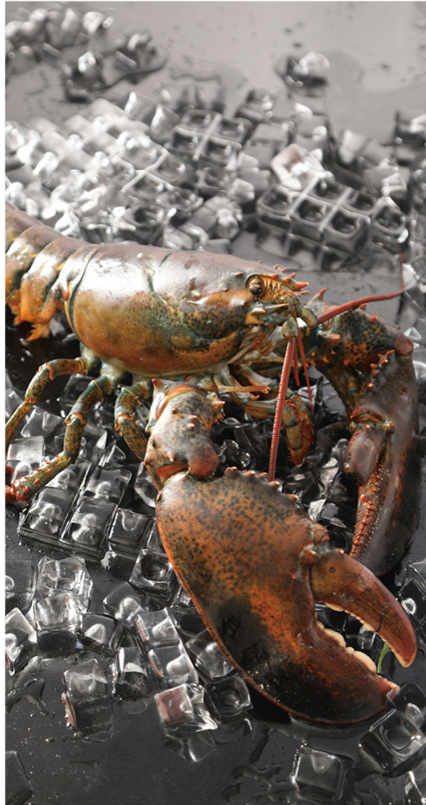
波士顿龙虾 Boston Lobster 做法：芝士牛油焗，姜葱炒 428 元/斤 建议：8-10 人