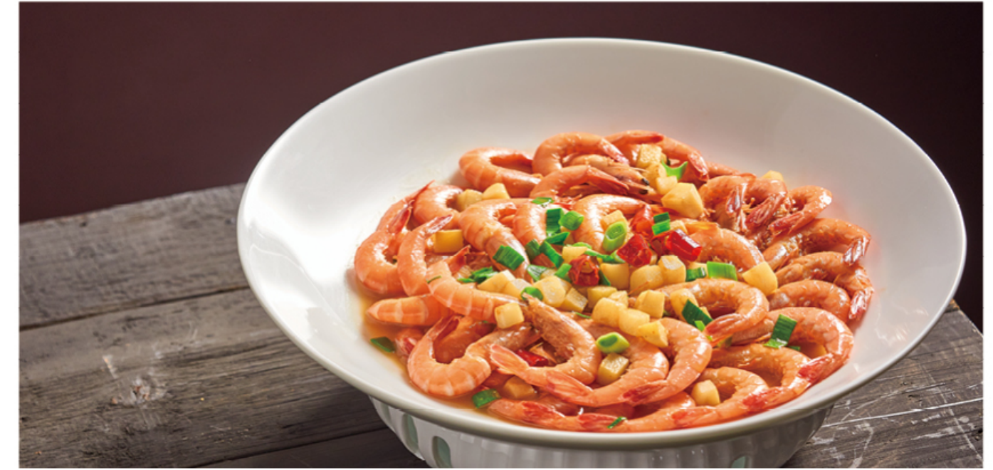
鹰爪虾 White-Hair Rough Shrimp 做法：家烧，油爆 198 元/例