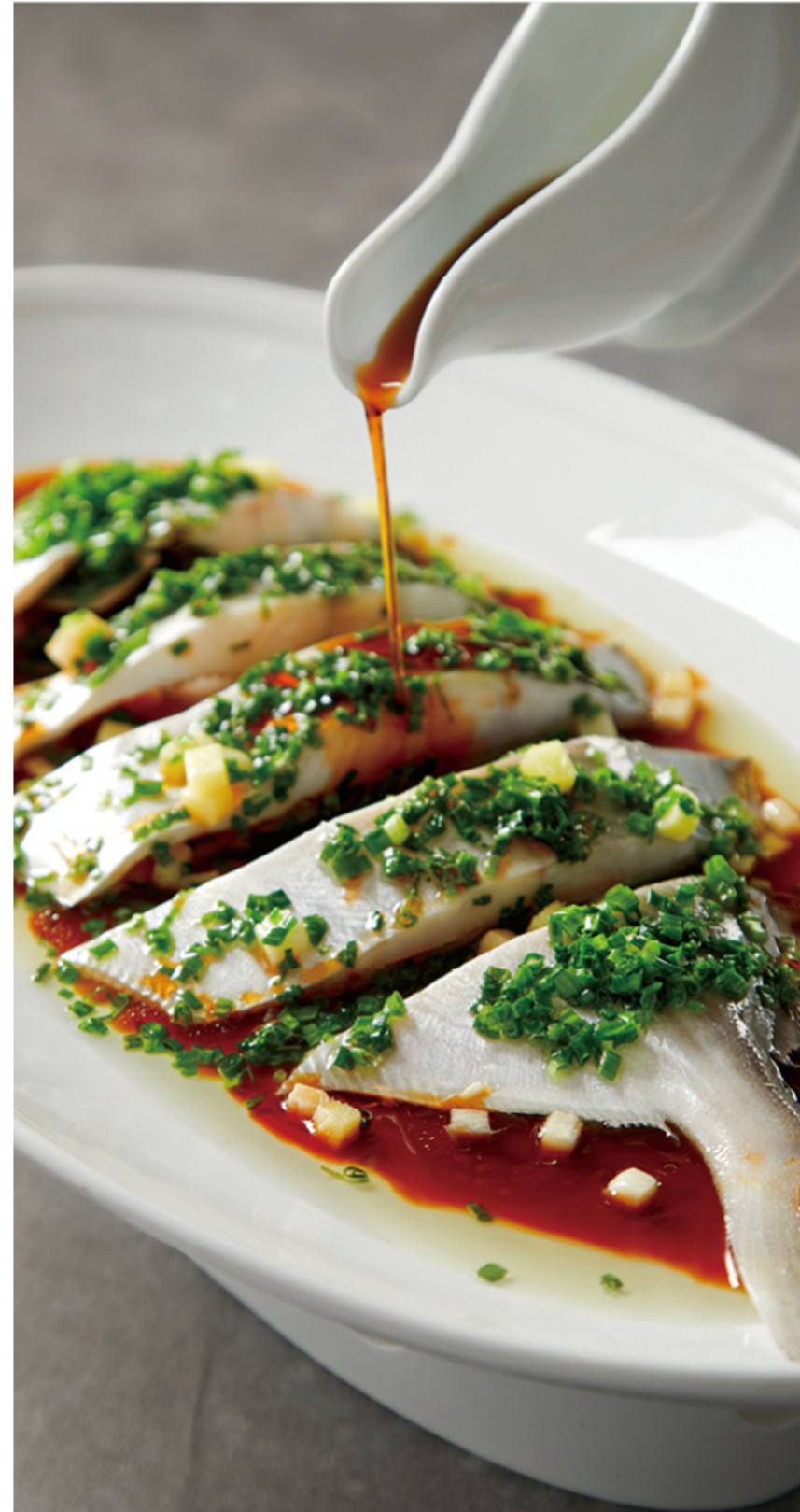
东海鲳鱼 Pomfret 做法：家烧，葱油 598 元/条 建议：8-10 人