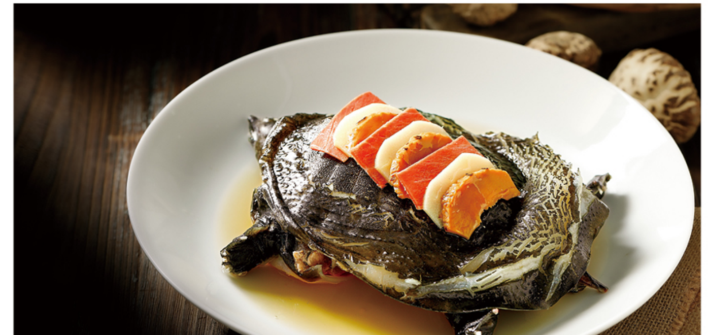
甲鱼 Soft-Shelled Turtle 做法：黄焖，冰糖 368 元/例 建议：8-10 人