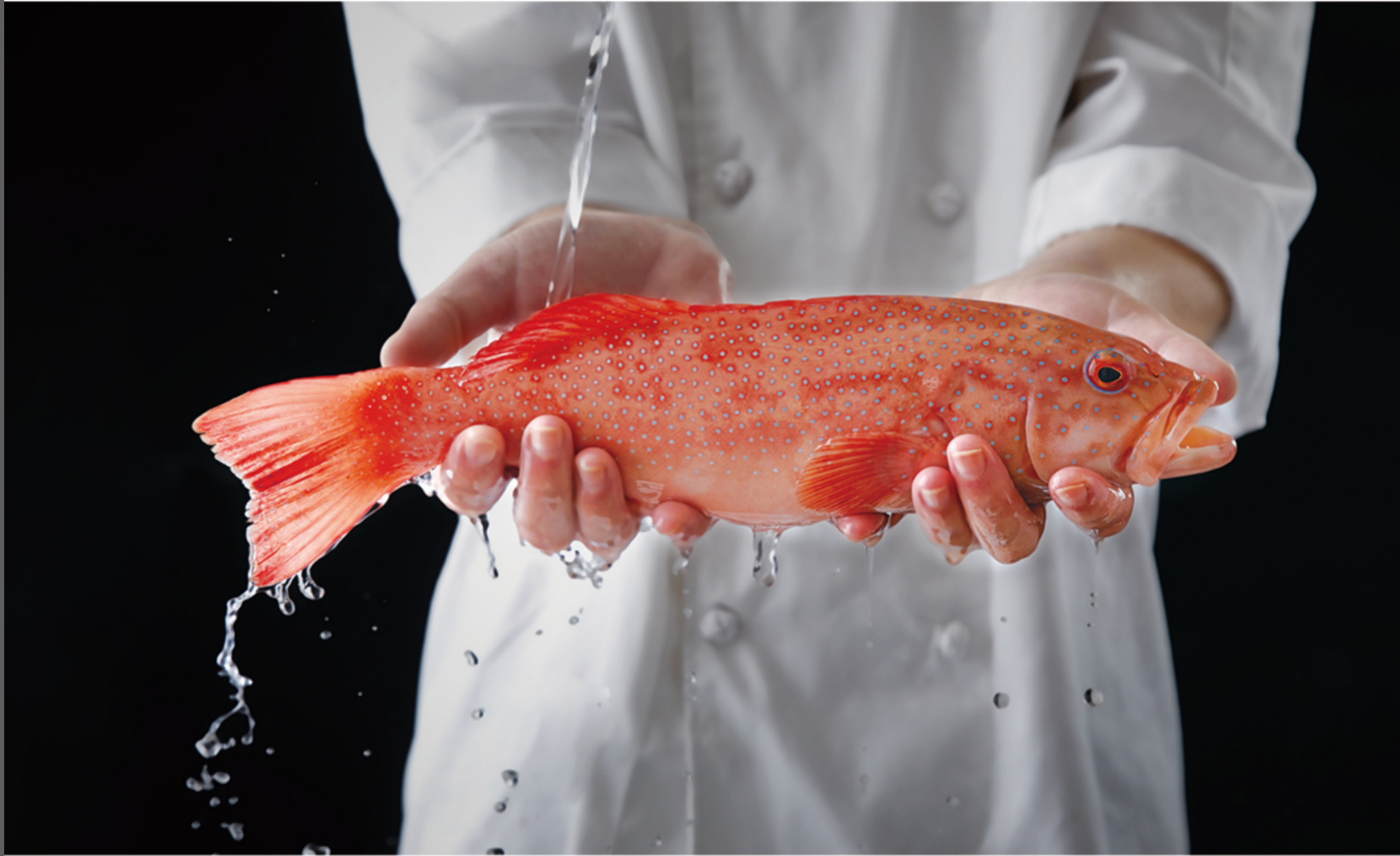
东星斑 Coral Grouper